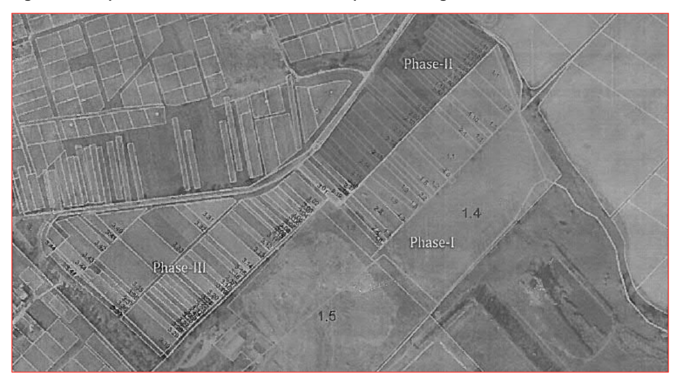
Figure 4-1 – Spetskomuntrans' Phased Land Acquisition Programme