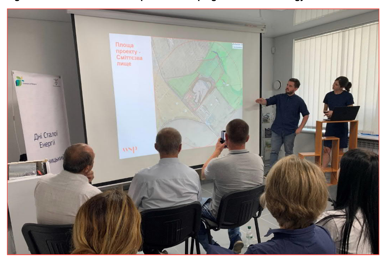
Figure 3-1 – Presentation to Explain the Scoping / ESIA Methodology